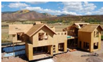
Part of our VISION House Series, this energy-efficient luxury home pushes the envelope for performance and high design. The house will be completed this fall.

Where housing and the environment connect