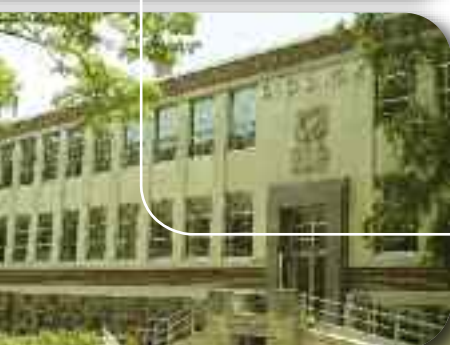
◀ Use InsulBloc® in new construction or to give new life to older buildings.