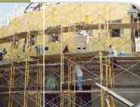
◀ InsulBloc® adheres to CMU, poured concrete, primed steel, wood and most other construction materials.